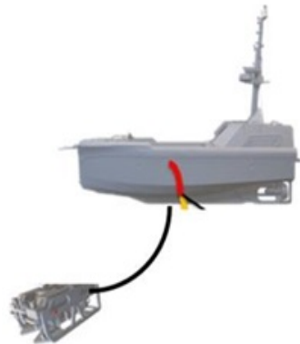
Image of ROV deployed