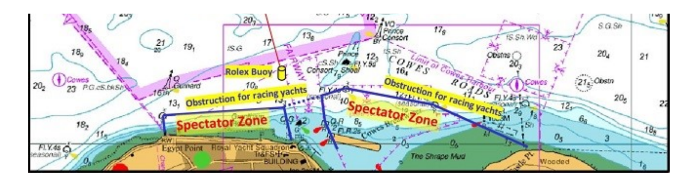
Chartlet 1: Fastnet Race Start Line