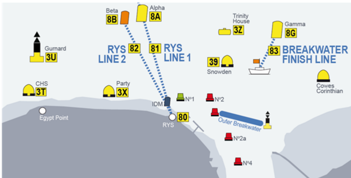
Figure 1: Cowes Week Regatta Start and Finish Lines.