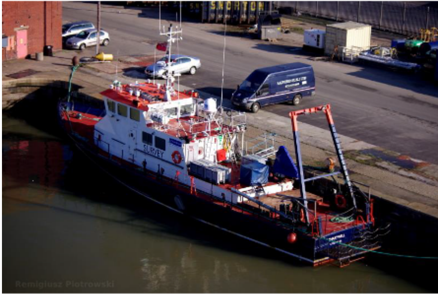
Figure 2 – HM DENHAM