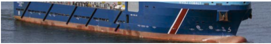
Figure 2 –IEVOLI COBALT