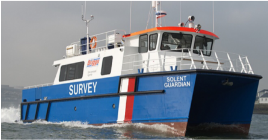
Figure 3 – SOLENT GUARDIAN

3. Both vessels will be considered to be Restricted in Ability to Manoeuvre while undertaking their survey operations and as such, mariners are reminded of their responsibilities under the COLREGS and are requested to remain well clear and to give a wide berth while passing. Both vessels will maintain a listening watch on VHF Channels 11 (QHM Harbour Control) and 12 (VTS Southampton) throughout. QHM and VTS can be contacted over VHF or by calling 023 9272 3694 (QHM) or 023 8048 8800 (VTS).