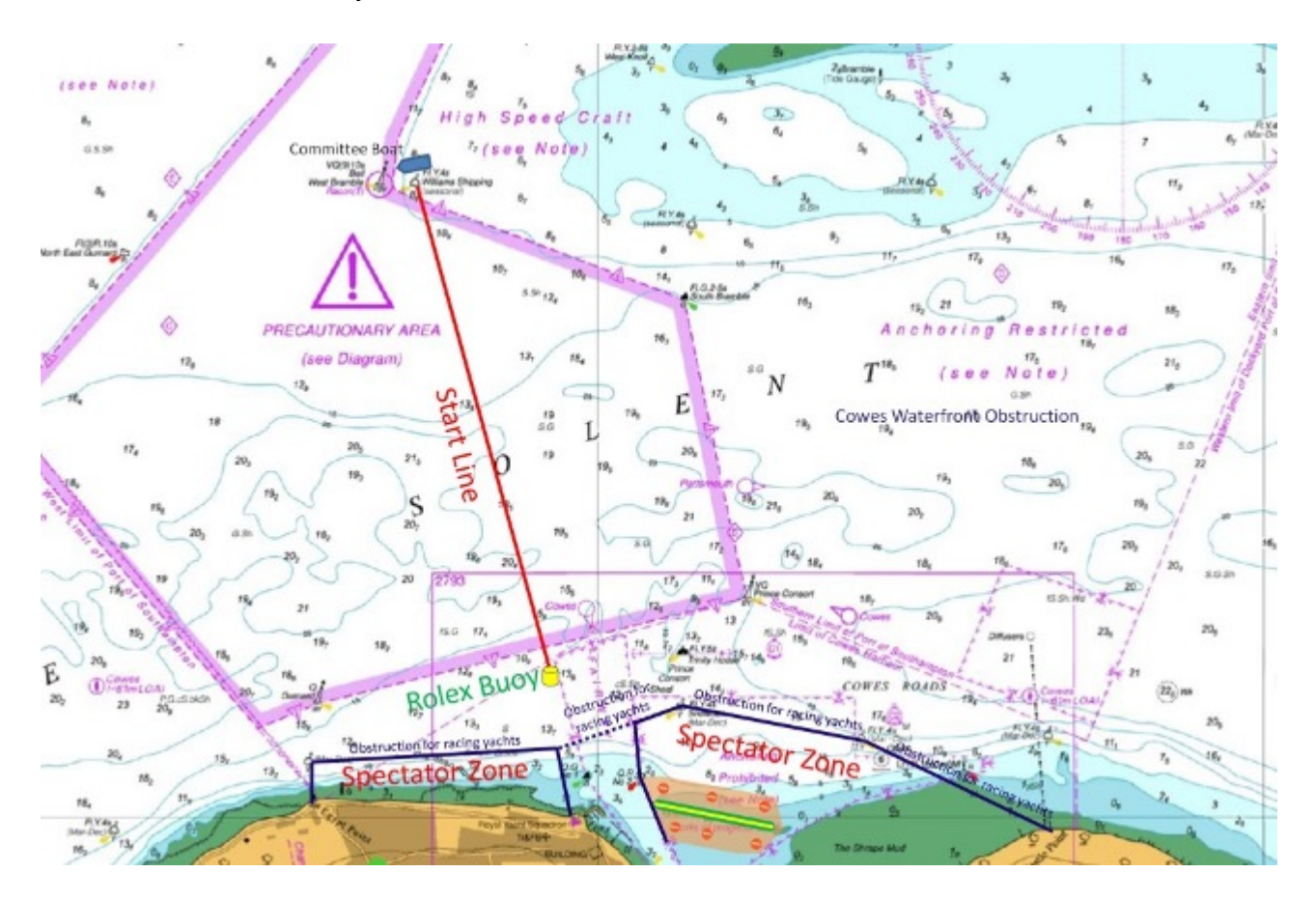
Chartlet 1: Fastnet Race Start Line

4. A Spectator Zone has been established, as indicated on Chartlet 2; boats racing in the Fastnet Race are prohibited from entering the Spectator Zone.