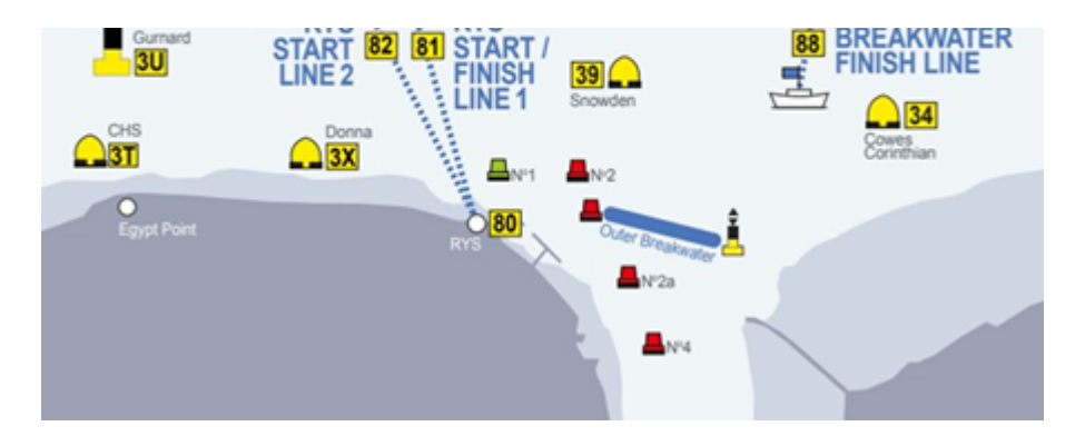
Figure 1: Cowes Week Regatta Start and Finish Lines.

4. The Precautionary Area (Thorn Channel). Mariners are advised that ABP Southampton Notice to Mariners No 06 of 2023 Port of Southampton – Precautionary Area (Thorn Channel) provides advice on the tracks followed by large vessels through The Precautionary Area in various tidal conditions (www.southamptonvts.co.uk).