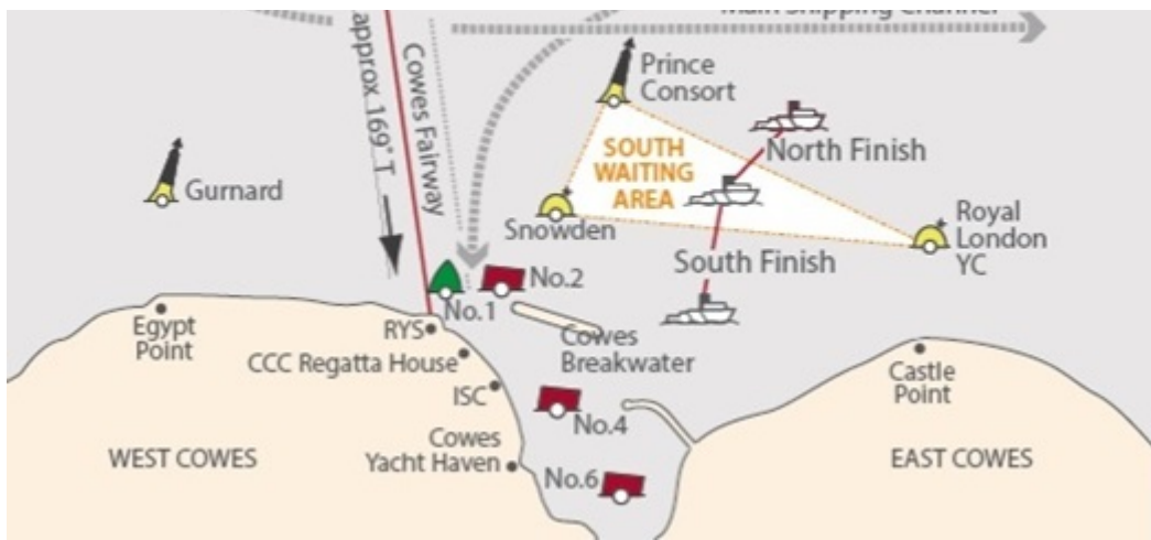
Figure 1 – Central Solent Start Area

f. When rounding Seaview all competitors must remain to seaward of the mooring area indicated on Figure 2. The area is indicated by a box originating from the shoreline at the north end of Seagrove Bay (the white flats) in approximate position 50°43.00'N, 001°06.30'W, out to 'Pier Head' which is a yellow spherical buoy (in approximate position 50°43.31'N, 001°05.63'W), northwest to the 'Line Post' which is a yellow post with blue windsock (in approximate position 50°43.60'N, 001°06.23'W), then directly back to the shoreline at Seaview Duver. One orange inflatable will be laid on the eastern side of the box and three orange inflatables will be equally spaced between Pier Head and the Line Post on the northern side of the box. Competing yachts disregarding the box and entering the Seaview mooring area will be subject to protest.