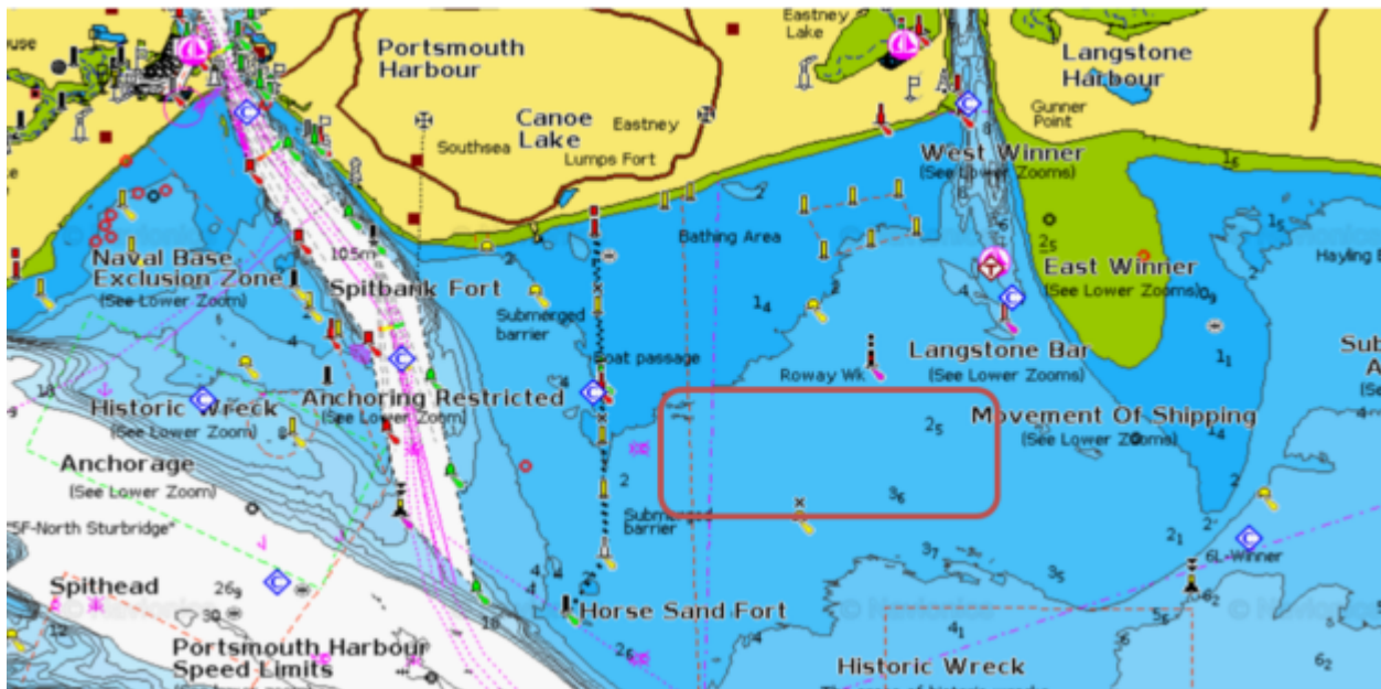
Fig 5. Roway Wreck Area: