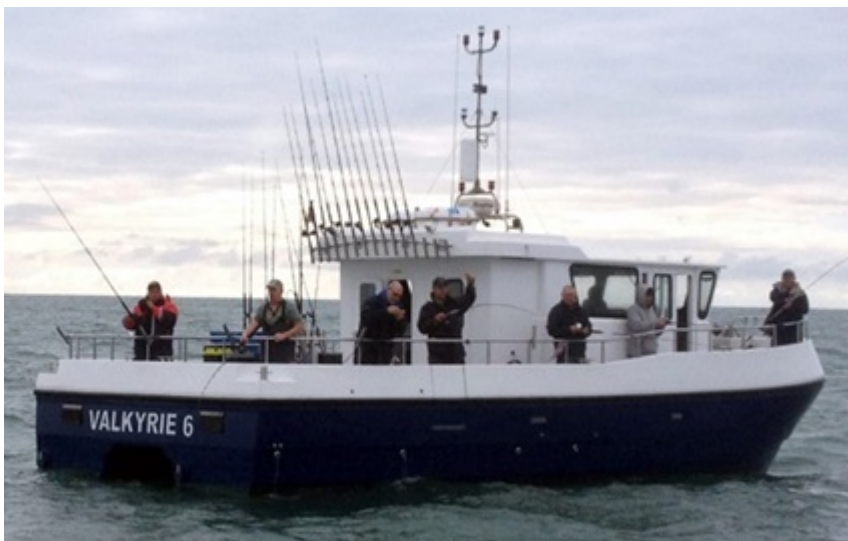
Valkyrie 6 (Bossy Boots Sister Vessel)