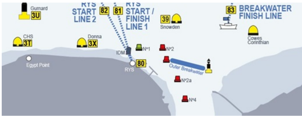
Figure 1: Cowes Week Regatta Start and Finish Lines.

4. The Precautionary Area (Thorn Channel). Mariners are advised that ABP Southampton Notice to Mariners No 08 of 2022 Port of Southampton – Precautionary Area (Thorn Channel) provides advice on the tracks followed by large vessels through The Precautionary Area in various tidal conditions ( www.southamptonvts.co.uk ).