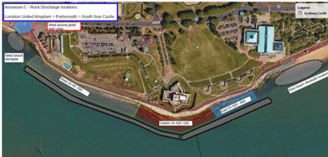
Southsea rock armour landing areas

1. NOTICE IS HEREBY GIVEN by the Queen's Harbour Master Portsmouth that as part of the Southsea Coastal Scheme works, during 2022 approximately 137,000 tonnes of rock armour will be delivered to seafront area in the vicinity of Southsea Castle.