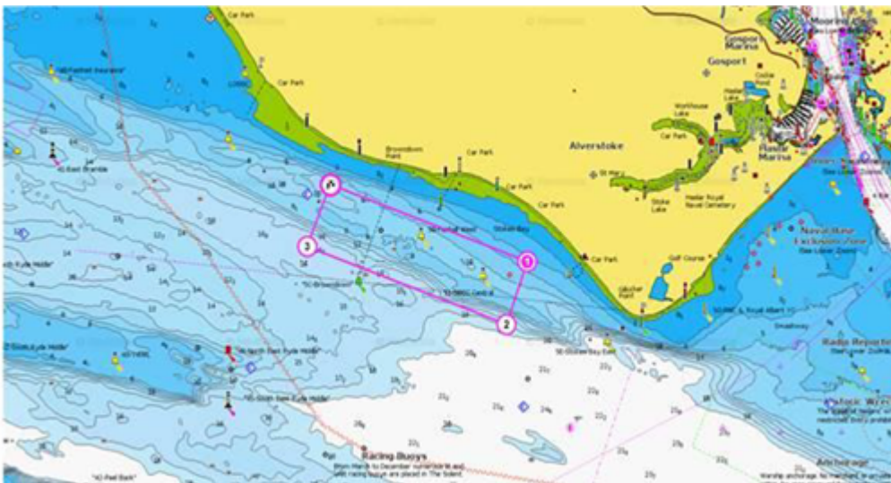
Stokes Bay trials area (Chart not to be used for navigation)

50°46'.684N 001°09'.463W 50°46'.362N 001°09'.647W 50°46'.765N 001°11'.398W 50°47'.085N 001°11'.196W