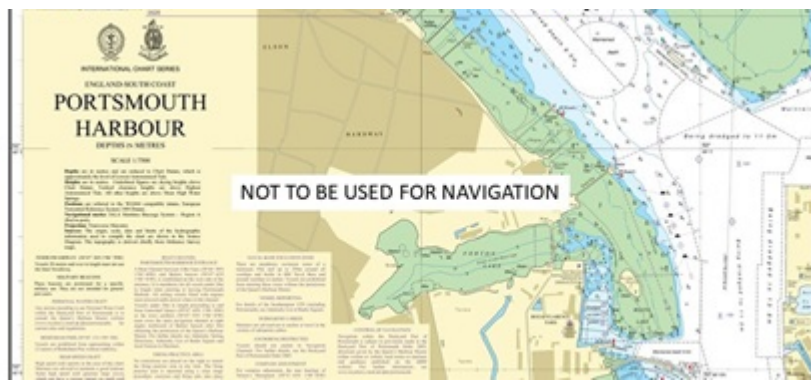
Figure 1: In harbour trials area