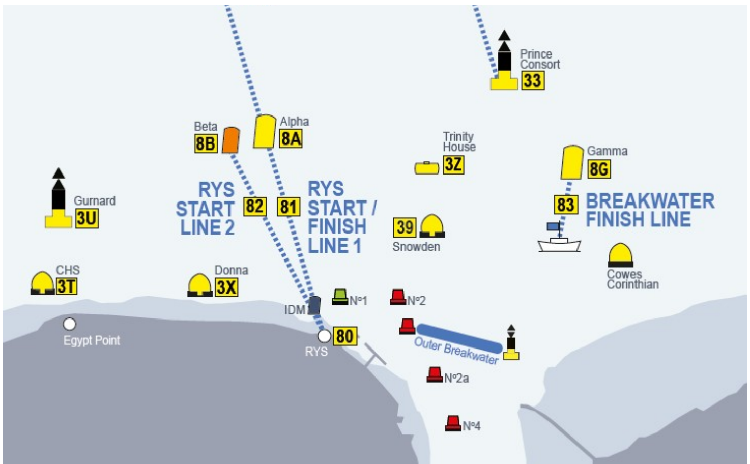
Figure 1: Cowes Week Regatta Start and Finish Lines.

4. The Precautionary Area (Thorn Channel). Mariners are advised that ABP Southampton Notice to Mariners No 09 of 2021 Port of Southampton – Precautionary Area (Thorn Channel) provides advice on the tracks followed by large vessels through The Precautionary Area in various tidal conditions ( www.southamptonvts.co.uk ).