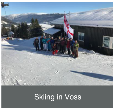
Skiing in Voss

Upon arrival in Bergen, a lot of the Ship's company were keen to make the most out of their short stay by hitting the slopes once more and made the journey to Voss for some more great runs in the snow. The conditions were perfect for beginners and experts alike with many members of HMS WESTMINSTER learning how to ski in one of the best locations in Norway.