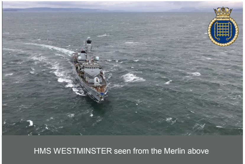
HMS WESTMINSTER seen from the Merlin above