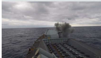
The 4.5 Gun being fired

Gunnery Serials are an essential part of the Ship's training, keeping operators up-to-date and proving the equipment; ensuring that if the Ship was tasked to use weaponry in an operational environment the drills would be second-nature. The Merlin helicopter managed to capture some fantastic footage of the gunnery, showing the immense firepower that a HMS WESTMINSTER can unleash.