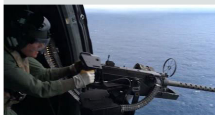
The M3M 50 Calibre Gun being fired from the Merlin

On 11-12 Feb 18 HMS WESTMINSTER fired 27 rounds from the Ship's Medium Range Gun (the turret on the Foc'sle), 190 rounds from the Ship's 30mm Automatic Small Calibre Guns (ASCGs) and 9000+ rounds from miniguns and General Purpose Machine Guns (GPMGs). The Ship's helicopter, a Merlin Mk 2, also proved its 0.50 calibre M3M machine gun by firing 600 rounds. The unfortunate target for this gunnery was a 'killer tomato', a large red inflatable target which is launched from the Ship.