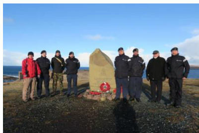
Photo of Loch Ewe Remembrance

SHIP'S COMPANY REMEMBER THOSE IN THE ARCTIC CONVOY