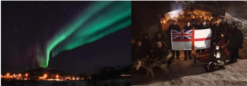
The Northern Lights over Tromsø and the team Husky Sledding

After a quick tutorial of how to 'mush', it was time to head off into the starlit mountains. A 2km trail with plenty of uphill and downhill meant there was plenty of time to soak in the stunning scenery of Tromsø, even at night. The terrain was sometimes too steep for even the strongest of dogs so the team were able to also fit in some physical activity when required to jump off the sledge and push it, running as part of the pack. After returning to the camp and warming up around the fire the team enjoyed a great show of the Northern Lights - a magical way to end a brilliant evening's experience.