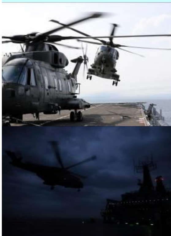
Merlin helicopters from 845 and 846NAS based at RNAS Yeovilton fine tune their ability to land on BULWARK's flight deck during both day and night flying operations ahead of JEF(M).

Please come and join us on any or all of these sites!