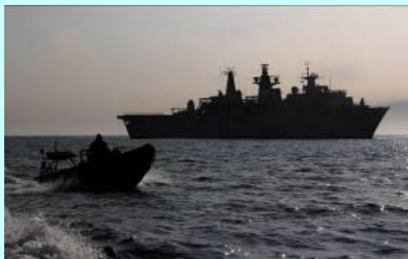
A PAC 22 seaboot from HMS BULWARK patrols the sea.