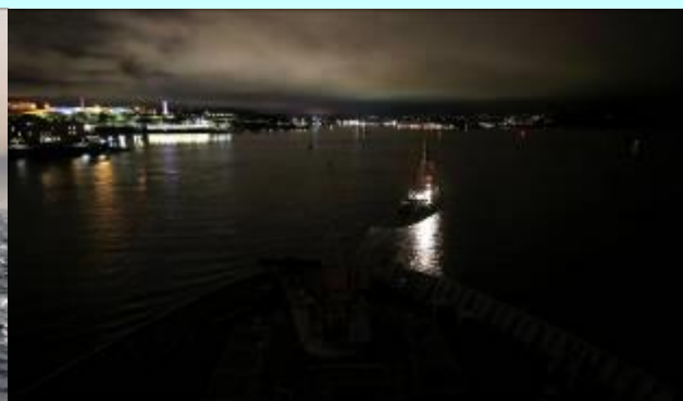
Leaving Plymouth Harbour on the evening of the 19 th September 2016. The last time the Ship will leave Plymouth for at least the next 6 years!