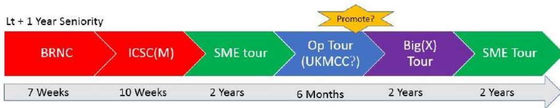
Figure App2/50B-1. Typical SUY(WO) Career Path

3. Although SUY(WO) scheme officers have a liability for operational deployments, the majority of their employment will be ashore within their specialist area with very occasional opportunities for broadening. With promotion to requirement being the main driver after merit, the prospects for promotion beyond Lieutenant Commander are extremely small for specialist Warfare officers.