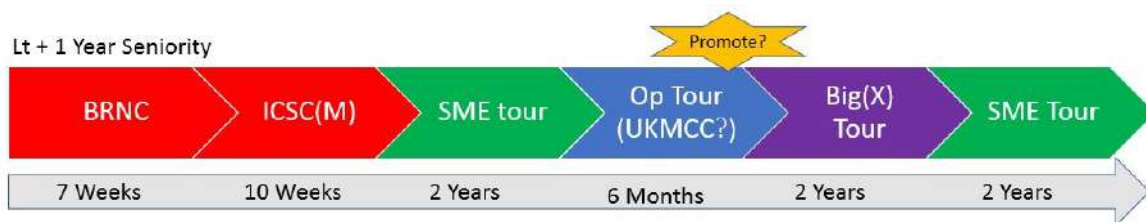
Figure 50B-1. Typical SUY(WO) Career Path

c. Although they have a liability for operational deployments, the majority of their employment will be ashore within their specialist area with very occasional opportunities for broadening. With promotion to requirement the main driver after merit, the prospects for promotion beyond Lieutenant Commander are extremely small for specialist Warfare officers.