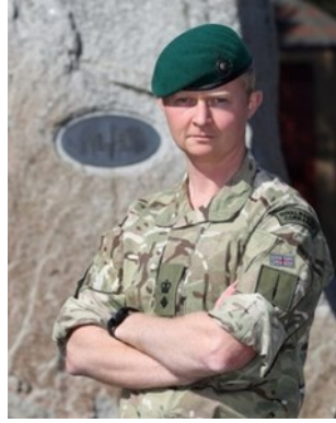
Commanding Officer 45 Commando Royal Marines