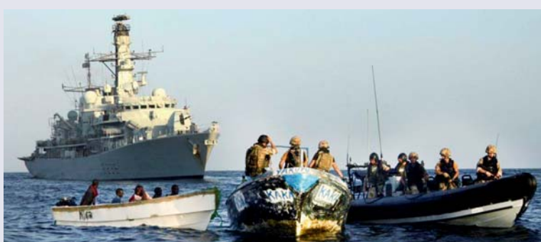
HMS Montrose boards a suspected pirate vessel off the Somali coast

Counter-Piracy - The Royal Navy is supporting the growing coalition (EU, NATO and beyond) of countries acting to counter piracy in the Gulf of Aden and Indian Ocean. Much of this international effort is coordinated from the UK via the Royal Navy led Operational Headquarters in Northwood Middlesex.