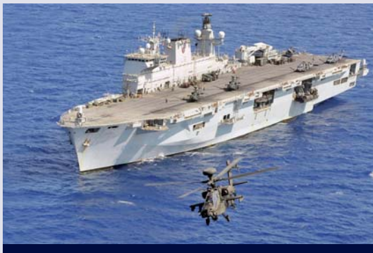
HMS Ocean was central to the action in Libya

The Royal Navy primarily exists for two reasons. First, to ensure that confidence in using the maritime environment to conduct trade and harness resources remains high. Second, when threats to the nation need to be dealt with at range, we must continue to be able to use the maritime environment to project power to reassure and ultimately protect our national interests.